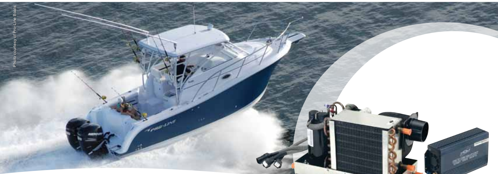
Cuddy dc 3,500 BTU/hr Kit

The Dometic Cuddy dc is a compact 3,500 BTU/hr cool-only air conditioner designed to work with 12 Volt power systems. Energized by a dedicated bank of batteries and a dedicated power module (DPM), the Cuddy dc makes your small cabin a refuge from the heat and sun. Compact—about the size of a typical battery box—this low-profile unit easily fits beneath a V-berth or in a storage area below deck. The Cuddy dc uses R-417A, a globally accepted, environmentally safe refrigerant.