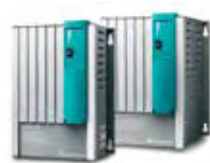
Mass GI 3.5 + Mass GI 7 isolation transformer