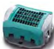
MasterShunt 500 Article no. 77020100