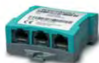
MasterBus Serial Interface Article no. 77030450