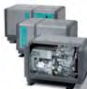
Whisper generators + MasterBus DDC Interface (art.no. 77031600)