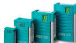
ChargeMaster range automatic battery chargers