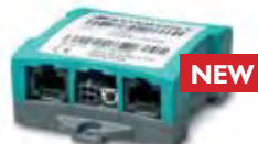
Battery Contactor Interface Article no. 77031700