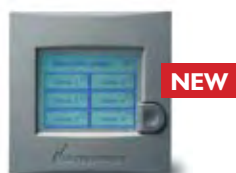
MasterView Easy MKII Article no. 77010305