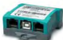
MasterBus USB Interface Article no. 77030100