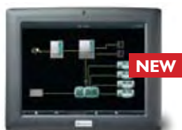
MasterView System Article no. 77010400