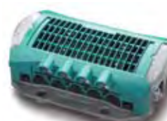
DC Distribution 500 Article no. 77020200