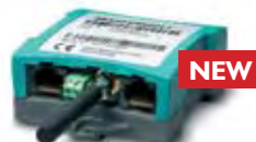
GPRS Module Article no. 77031000