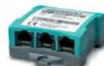
MasterBus Inverter Interface Article no. 77030700