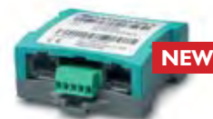
MasterBus Tanklevel Interface Article no. 77030300