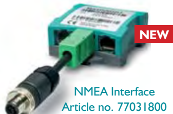
NMEA Interface Article no. 77031800