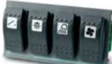
Switch Input 4 Article no. 77031400