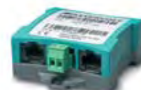
Digital AC 1x6A Article no. 77031500