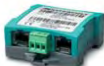
MasterBus Modbus Interface Article no. 77030800