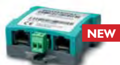
MasterBus Repeater Article no. 77031100