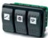
Switch Input 3 Article no. 77031300