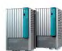
Mass Combi 12/2500-100 & 24/2500-60

Subject to change. For a complete overview of our products see www.mastervolt.com/masterbus