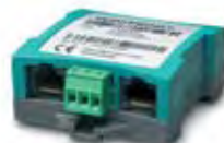
Multipurpose Contact Output Article no. 77030500