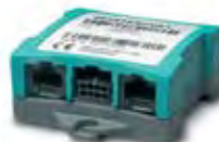
Digital Input Article no. 77030900